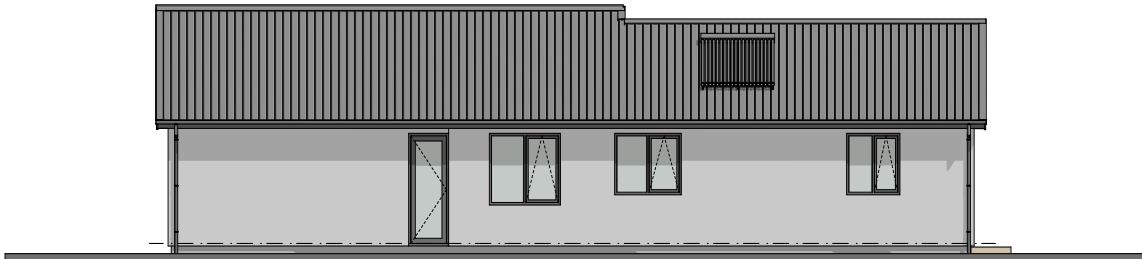
1 Waianiwa Place