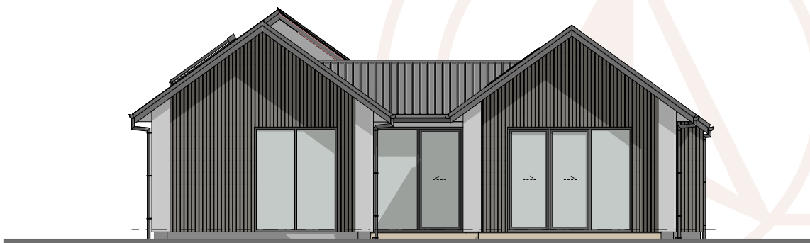
1 Waianiwa Place