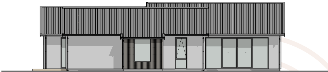
1 Waianiwa Place