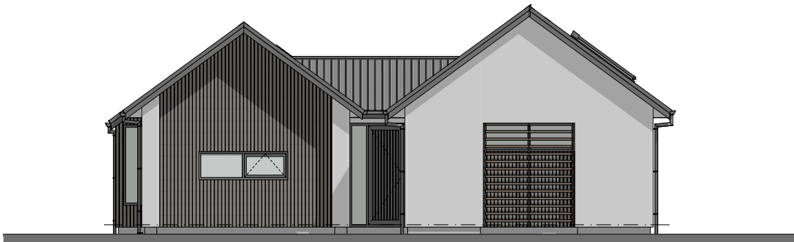
1 Waianiwa Place